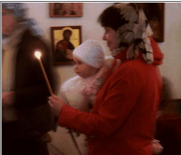
Holy Week procession of maidens