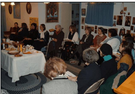
Newly formed sisterhood