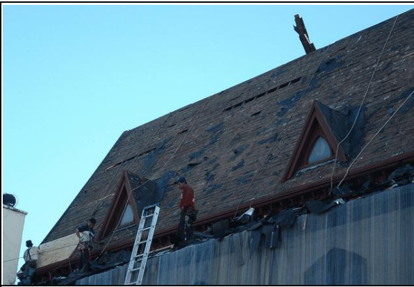
A new roof is installed