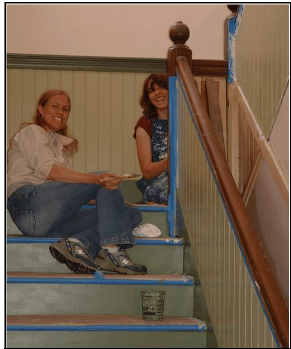
A new shade of green