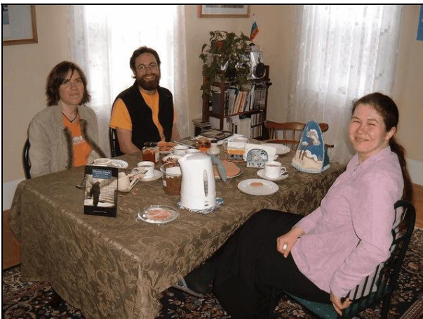
Families Interested in Theology