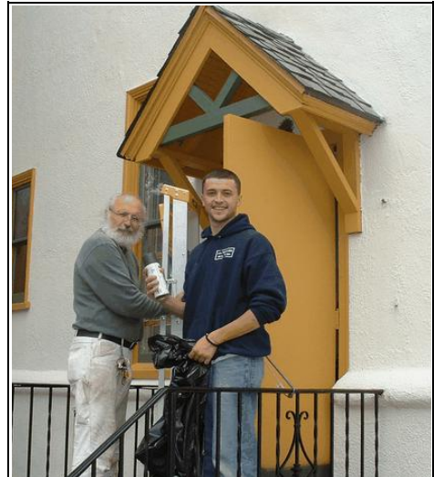
Side entrance is refurbished