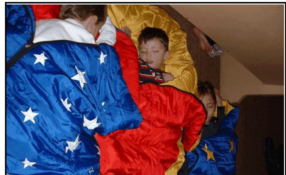
Children sleep away Nativity Eve services