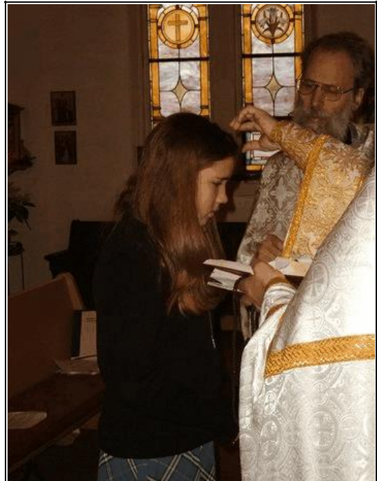
A reader is tonsured