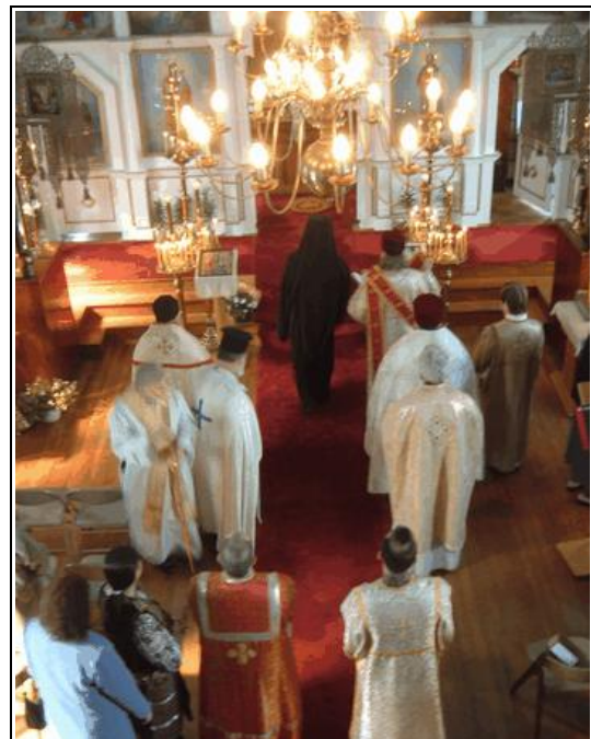
Nativity of the Theotokos Church in Chelsea