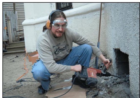
Tearing down walls, Building up bridges