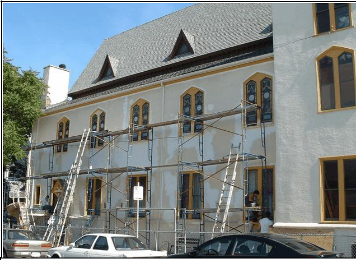
Scaffold for painting