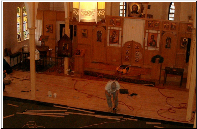
Hardwood floors replace old carpet in the sanctuary