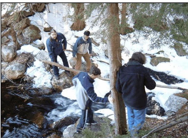
Brotherhood in nature