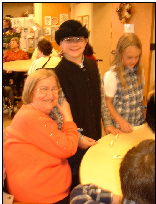
Brookline Senior Center