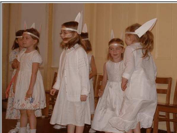
Children's Garden performers