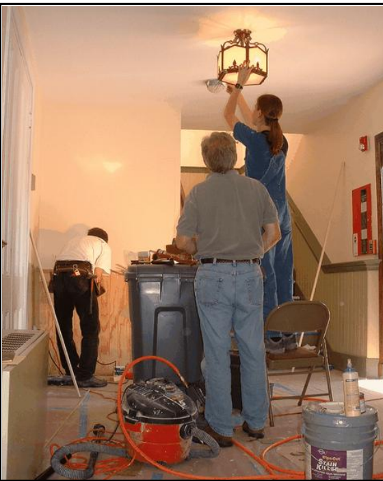
Fixtures are replaced