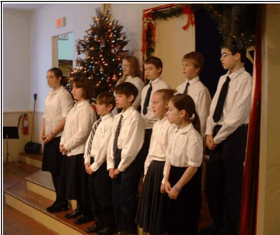
Annual Christmas Program

St. Herman's School completed its 14th year of operations. It saw many welcome changes like the hiring of new staff and taking on new students. Alumnae of the school are studying at schools and serving the church all over the world. St. Herman would be pleased that his own far reaching missionary efforts are being repeated in this new generation of God's servants.