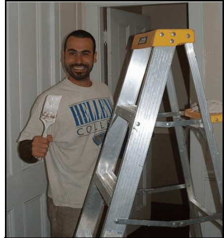
Paint, paint, paint!