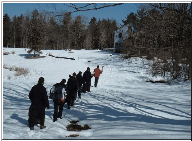
Men's Lenten Govenie