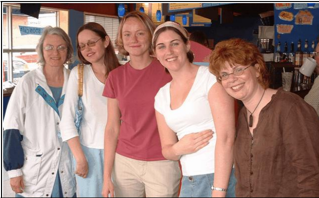
Teachers from a school for the deaf visit our school