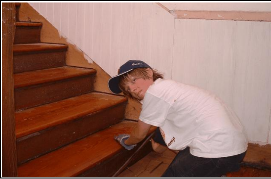
Front entry stairs sanded and stained