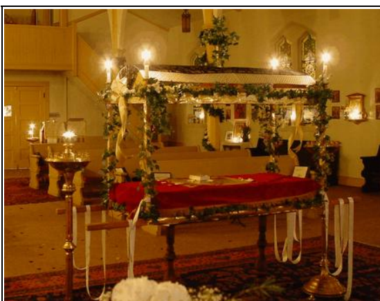
Epitaphion adorned for Holy Pascha