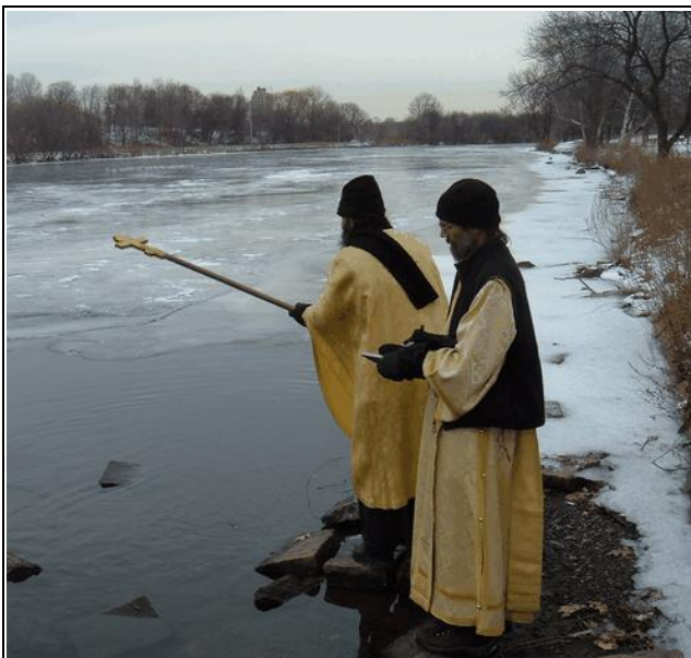
Blessing the waters of the Charles R. on Theophany