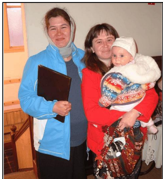
Two mommies after service