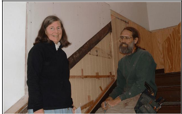
Old wainscoting replaced with new wood