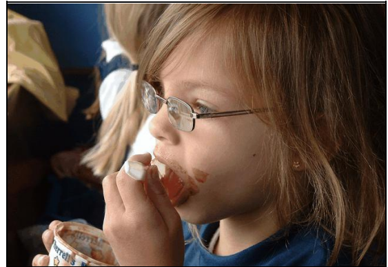
A student from the deaf school