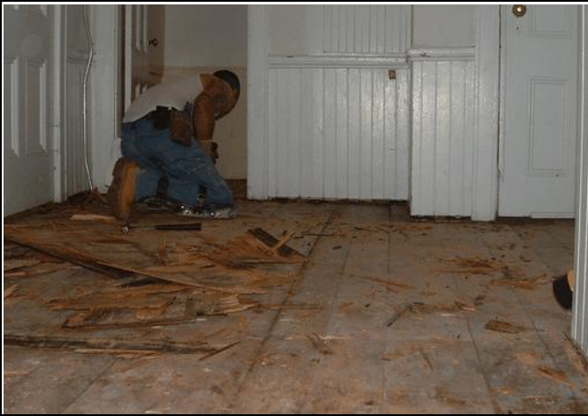
Old flooring removed