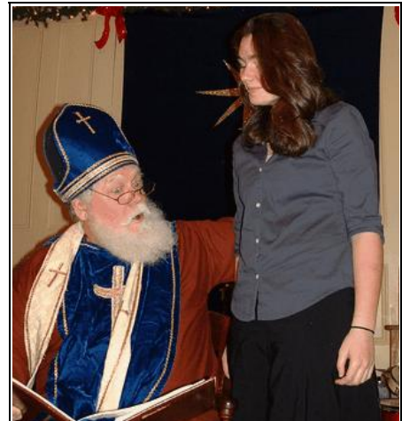
St. Nicholas reports on an alumna