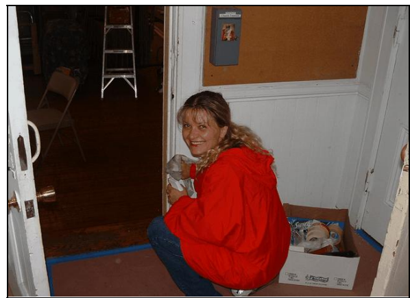
Cleaning every crevice