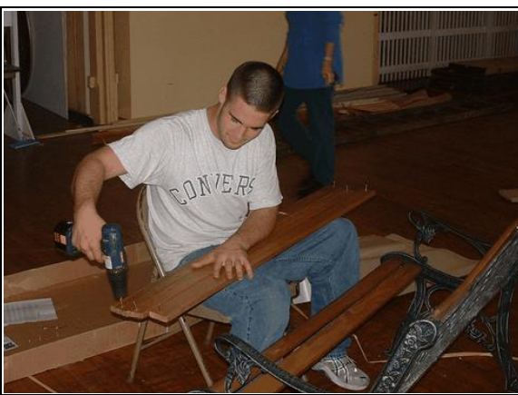
Outside benches assembled