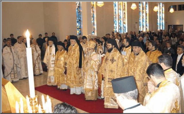
Sunday of Orthodoxy, Worcester, MA